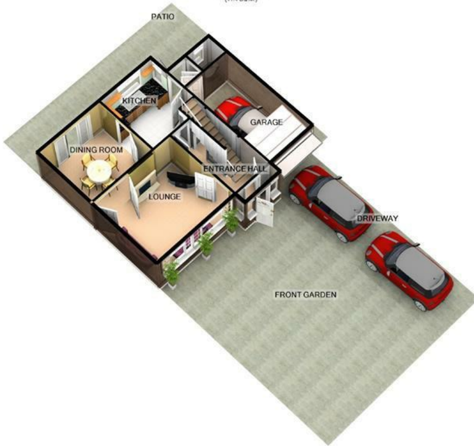
GROUND FLOOR APPROX. FLOOR AREA 609 SQ.FT. (56.6 SQ.M.)

TOTAL APPROX. FLOOR AREA 1055 SQ.FT. (98.0 SQ.M.)